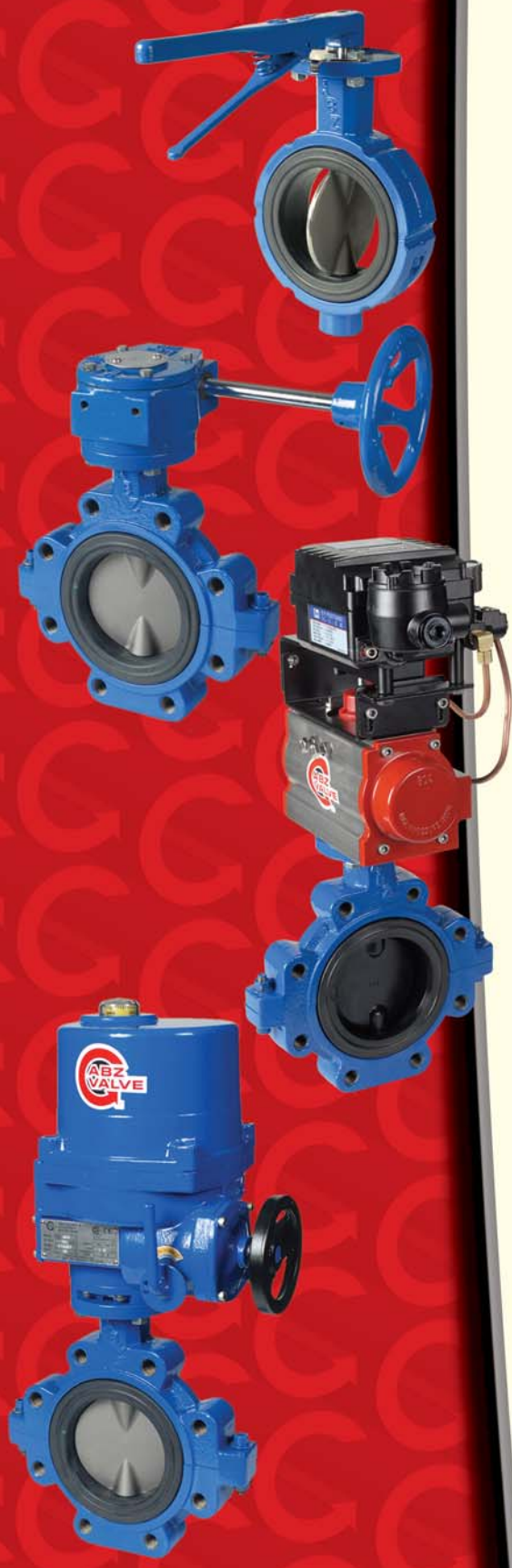
Rated Flow Coefficient (Cv) - Figure 090/929