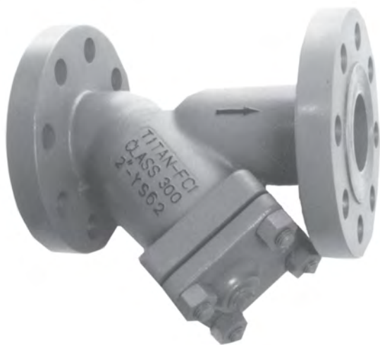
2" YS 62-CS

Models: YS 62-CS (Carbon Steel) YS 62-SS (Stainless Steel)