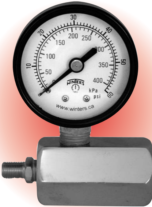
Gas Test Gauge