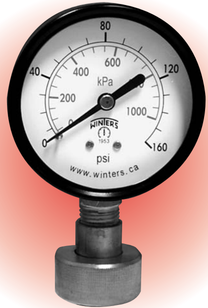
Water Test Gauge