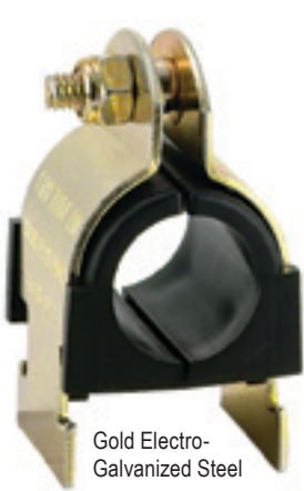
Gold Electro-Galvanized Steel